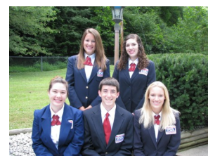
Past TSA State Officers

You may also register with the National TSA Association at www.tsaweb.org .