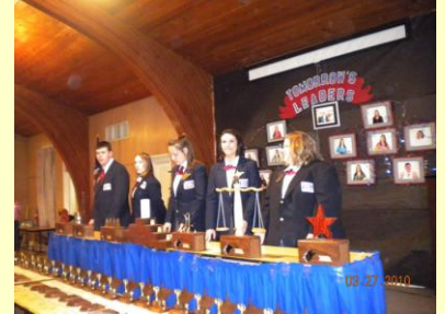
2010 WV TSA State Conference Cedar Lakes, Ripley, WV

The WV TSA Spring Conference provides competition in more than 25 events, a campaign and election of state officers, workshops and interest sessions, a formal banquet, and a variety of social events.