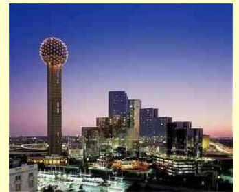
Dallas, Texas Skyline

TSA National Conference is the climax of the TSA year. All state associations gather to compete in the highest level of competitive events and to elect the new national officer team. Special interest sessions and keynote speakers highlight the conference activities.